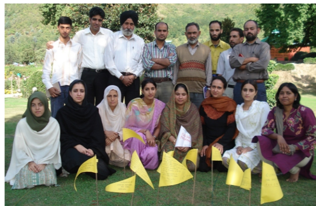
From top to bottom - The Institute's Knowledge Management Centre - Prototype Making & Sampling Workshop - Computer Studio - The Institute's present team