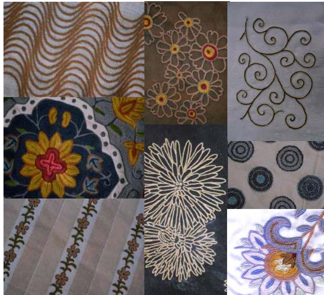
A collage of designs evolved during the workshop